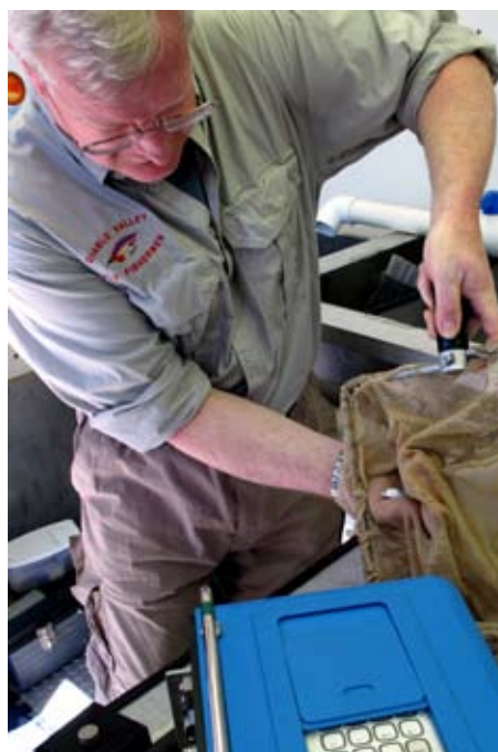
Students raised these salmon fry from adults they caught in a local creek earlier in the year

Northern California Lower Sac - Trinity - Fall River Pit - Hat - McCloud - Upper Sac