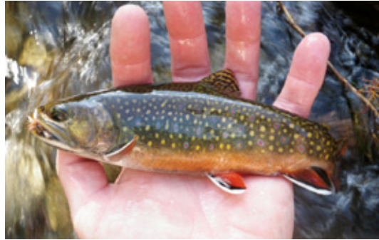
Rock Creek brook trout in spawning colors.

That learning was put to the test Thursday, when Willy and I spent the day in his boat, searching for open channels and properly positioning the boat. Eight hook ups, with one beefy brown to the net and three rainbows lost — big fish that jumped and cleared the water by a body length or more — suggested we'd done well.